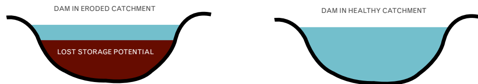
Degraded ecological infrastructure leads to reduced capacity and lifespan of dams, and increased maintenance costs

The good news is that restoration of wetlands and improved management of grasslands in the catchment will directly support the functioning of the Mount Fletcher Dam and increase its lifespan.